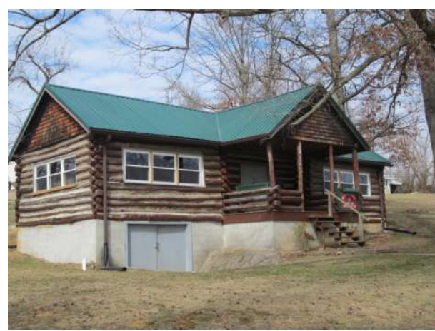
City of Central City: Scout House

Muhlenberg County 4H - Horse Club Muhlenberg County 4H - Shooting Sports Muhlenberg County American Red Cross Muhlenberg County Board of Education Muhlenberg County Extension Service - 4-H/Youth Development Muhlenberg County Extension Service - Family & Consumer Science Muhlenberg County Extension Service - Fine Arts Muhlenberg County Fiscal Court Muhlenberg County High School Muhlenberg County Junior Pro Football, Inc. Muhlenberg County Literacy Council Muhlenberg County Opportunity Center EMERGENCY MEDICAL SERVICES Muhlenberg County Public Libraries Muhlenberg County Special Olympics Muhlenberg Green Recycling Team