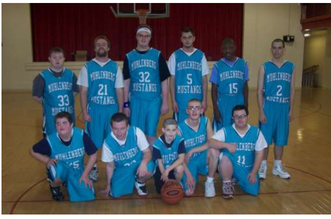
Muhlenberg County Special Olympics

Family Advocacy Center First Baptist Church Greater Muhlenberg Parks & Recreation System Greenville Elementary School Greenville Little League Greenville United Methodist Church Greenville Volunteer Fire Department Habitat for Humanity Hoofbeats, Heartstrings & Hopes, Inc. Junior Achievement of Western Kentucky Madisonville Community College McCallie School Muhlenberg Community Hospital Muhlenberg Community Theatre, Inc.