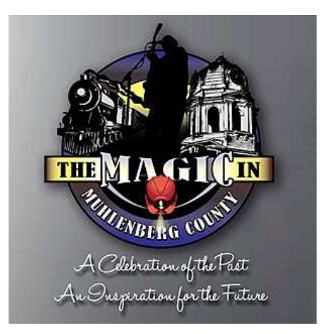
Muhlenberg County Extension Service: Arts Advisory Council

Muhlenberg North Middle School Muhlenberg South Elementary Muhlenberg South Middle School National Thumbpickers Hall of Fame Pathway of Hope Pennyrile Allied Community Services - Retired & Senior Volunteer Program Pennyrile Area Development District Pennyroyal Center RiverPark Center Second Baptist Church South Central Kentucky Kids on the Block STAND (Students Teaching About Negative Decisions) The Flying Mules University of Kentucky Center for Rural Health