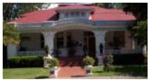
Duncan Center Museum & Art Gallery