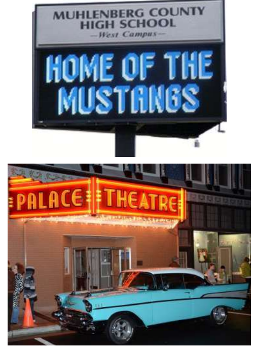
Muhlenberg Community Theatre, Inc.

Muhlenberg North Middle School Muhlenberg South Elementary Muhlenberg South Middle School National Thumbpickers Hall of Fame Pathway of Hope Pennyrile Allied Community Services - Retired & Senior Volunteer Program Pennyrile Area Development District Pennyroyal Center RiverPark Center Second Baptist Church South Central Kentucky Kids on the Block STAND (Students Teaching About Negative Decisions) The Flying Mules University of Kentucky Center for Rural Health