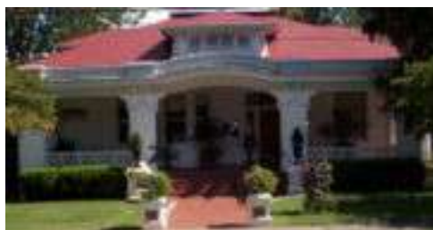
Duncan Center Museum & Art Gallery