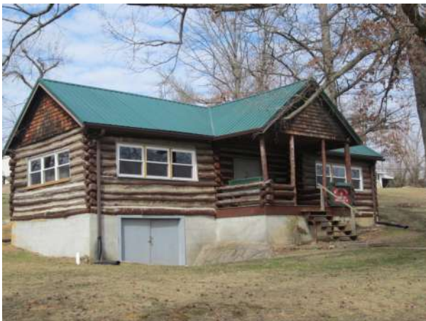
City of Central City: Scout House