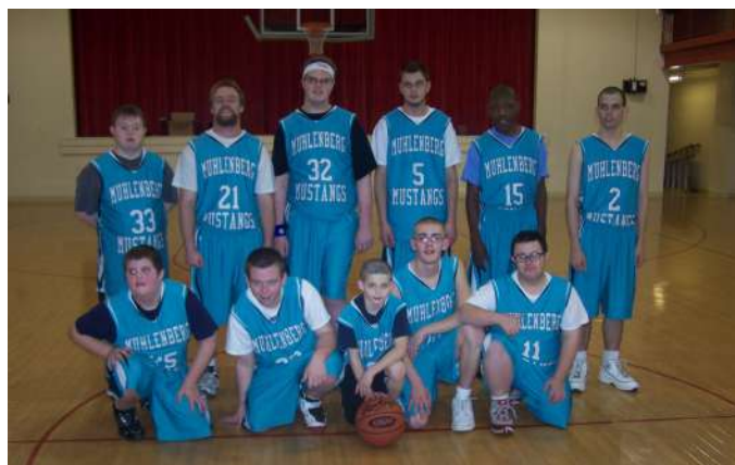
Muhlenberg County Special Olympics

Family Advocacy Center First Baptist Church Greater Muhlenberg Parks & Recreation System Greenville Elementary School Greenville Little League Greenville United Methodist Church Greenville Volunteer Fire Department Habitat for Humanity Hoofbeats, Heartstrings & Hopes, Inc. Junior Achievement of Western Kentucky Madisonville Community College McCallie School Muhlenberg Community Hospital Muhlenberg Community Theatre, Inc.