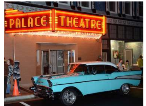
Muhlenberg Community Theatre, Inc.