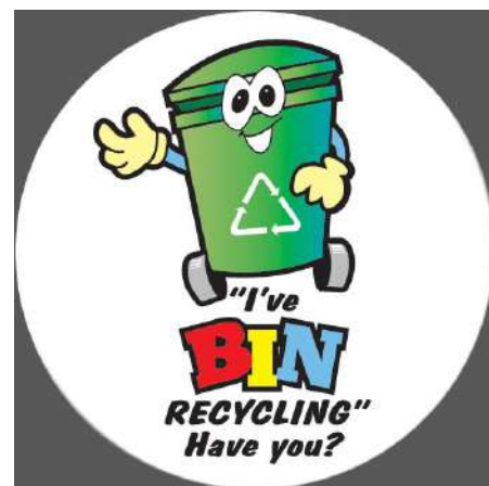
Muhlenberg Green Recycling Team