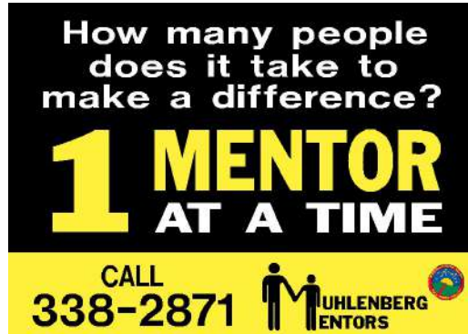
Muhlenberg County Schools: Muhlenberg Mentors

American Red Cross, Mid-West Chapter Big Brothers Big Sisters Bremen Elementary School Center for Nonprofit Excellence Central City Convention Center Central City Elementary School/Daycare Champions for a Drug Free Muhlenberg County Church of Jesus Christ City of Central City City of Drakesboro City of South Carrollton Cleaton Missionary Baptist Church Community Health Centers of Western Kentucky Duncan Center Museum & Art Gallery Ebenezer Missionary Baptist Church