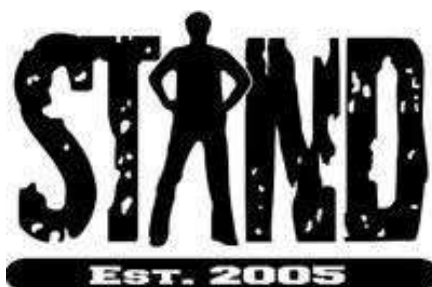
Muhlenberg County Extension Service: Students Teaching About Negative Decisions