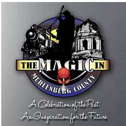
Muhlenberg County Extension Service: Arts Advisory Council

Muhlenberg North Middle School Muhlenberg South Elementary Muhlenberg South Middle School National Thumbpickers Hall of Fame Pathway of Hope Pennyrile Allied Community Services - Retired & Senior Volunteer Program Pennyrile Area Development District Pennyroyal Center RiverPark Center Second Baptist Church South Central Kentucky Kids on the Block STAND (Students Teaching About Negative Decisions) The Flying Mules University of Kentucky Center for Rural Health